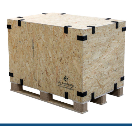
All componentry is delivered in a heat-treated OSB transport box made by Clip-Lok. The box can be dismantled entirely or as sections to facilitate unpacking the product.