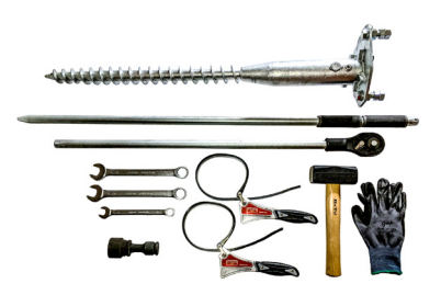
Quality tools are included for installation and disassembly.